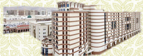
PULLMAN ZAMZAM MADINAH